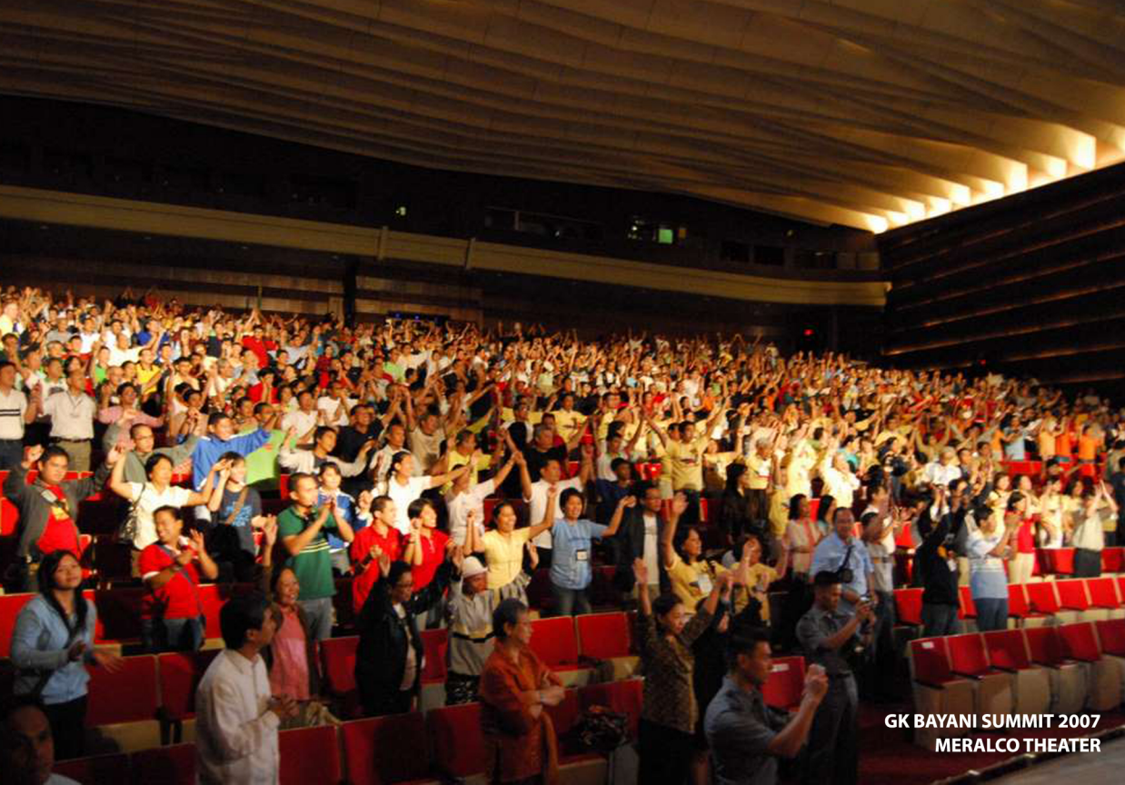
GK BAYANI SUMMIT 2007 MERALCO THEATER