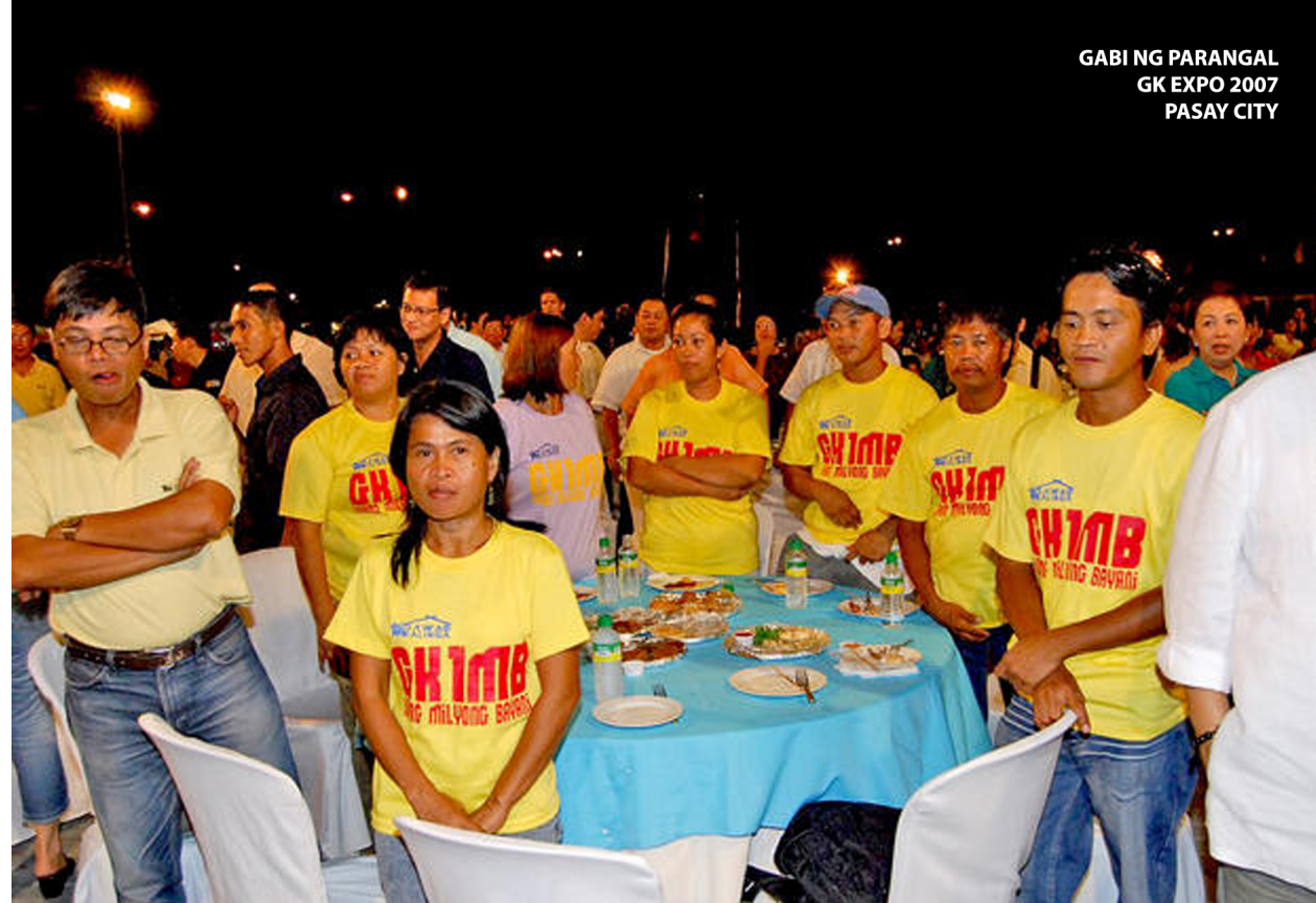
GABI NG PARANGAL GK EXPO 2007 PASAY CITY