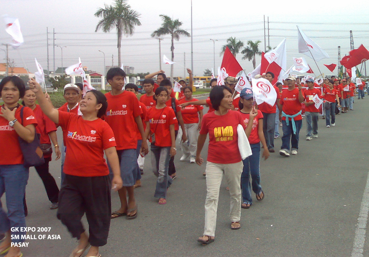
GK EXPO 2007 SM MALL OF ASIA PASAY