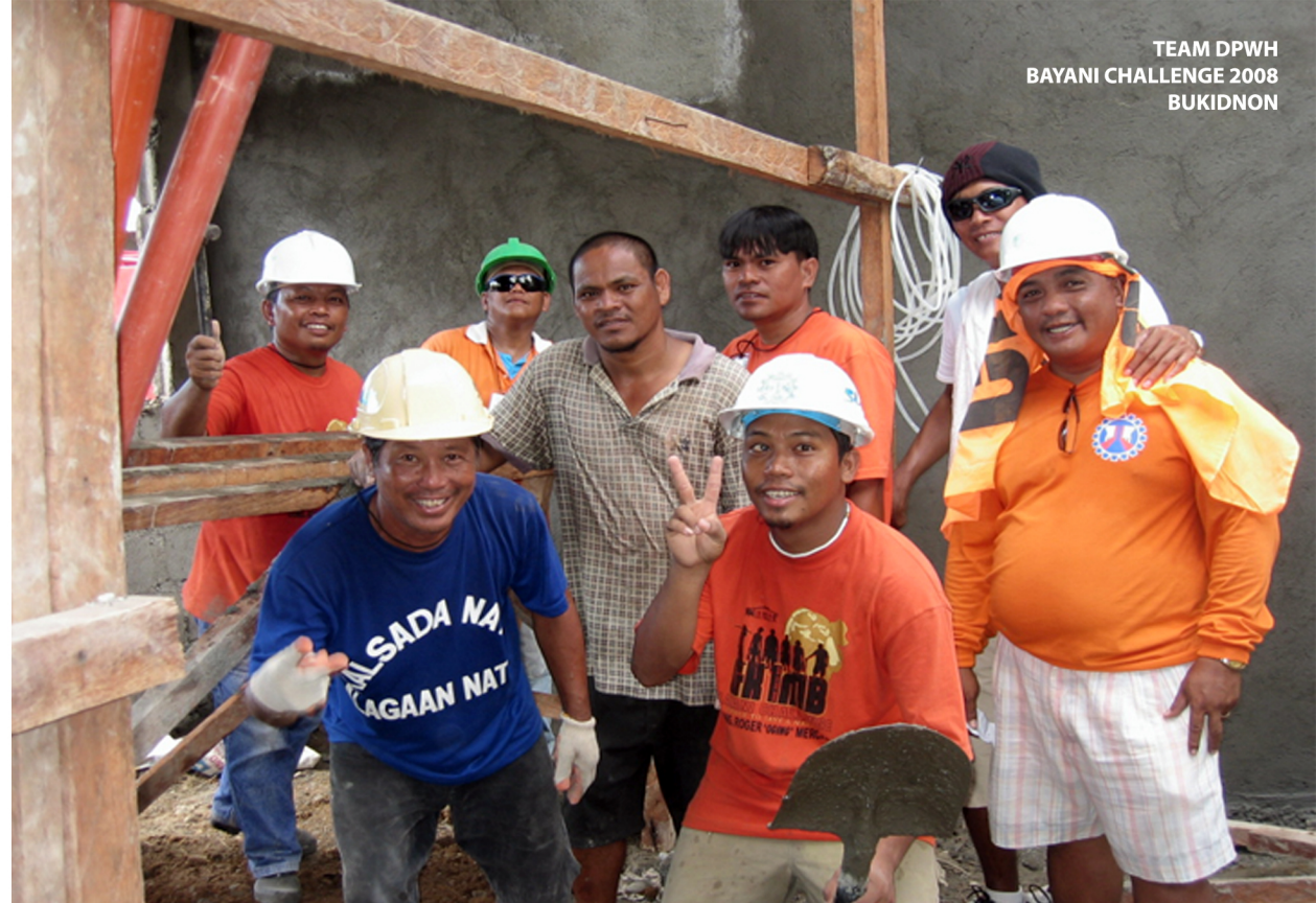
TEAM DPWH BAYANI CHALLENGE 2008 BUKIDNON