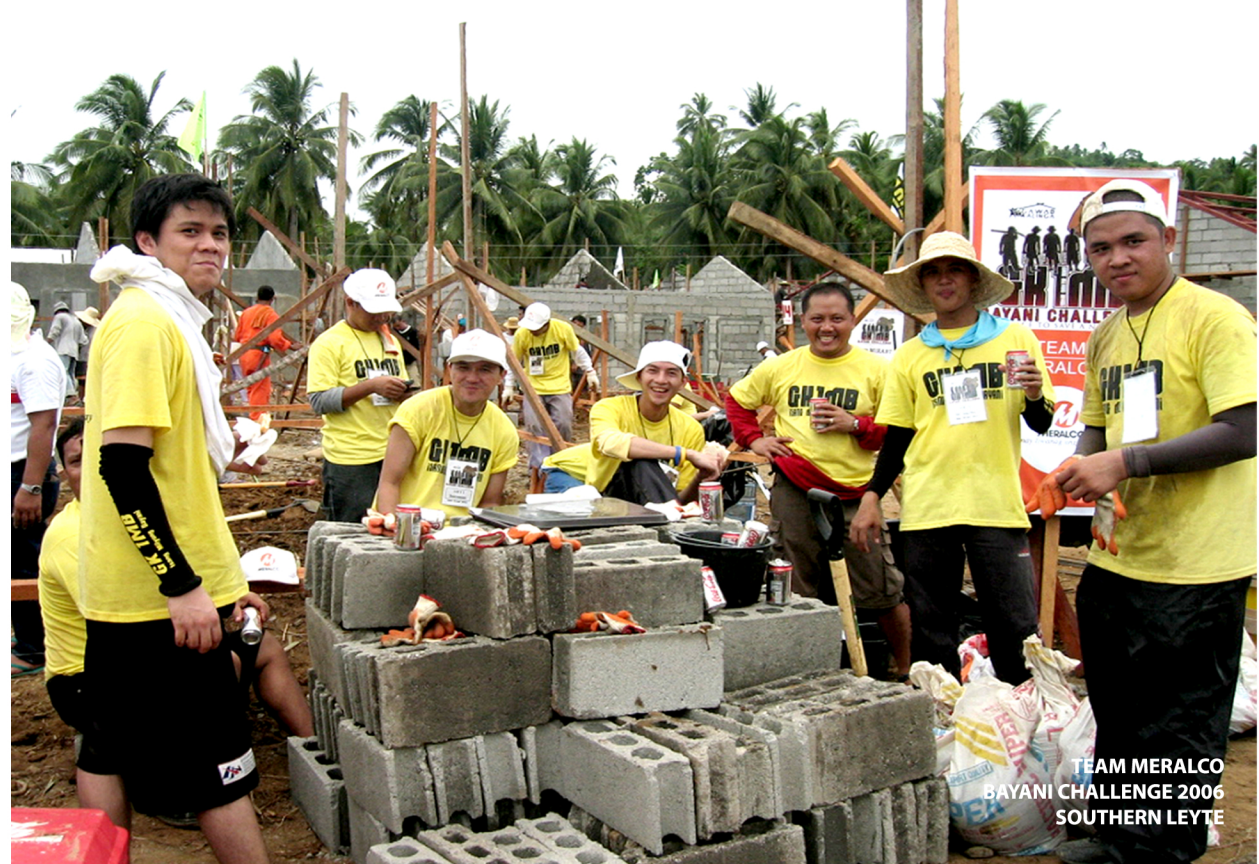
TEAM MERALCO BAYANI CHALLENGE 2006 SOUTHERN LEYTE